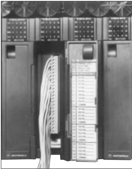
Plug-in I/O module showing LEDs and user connector