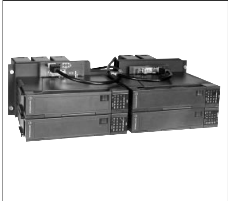
MOSCAD 600 for Fault Management systems